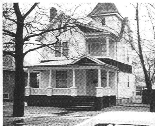
6748 N. Oxford Av.