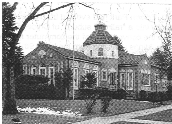
7058 N. Olcott Av.