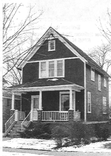
6950 N. Overhill Av.

Most of Edison Park was annexed by the city of Chicago in 1910, although part of the community area remained outside the city until 1924. Public works projects, such as street paving, were plentiful