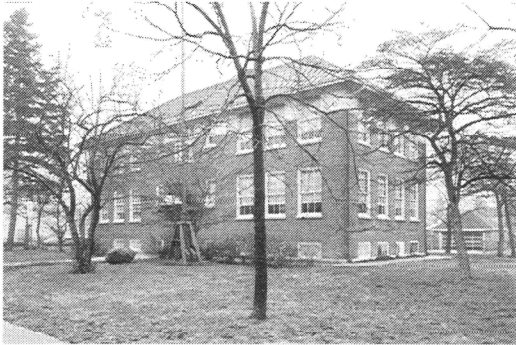
Edison Park School (now Edison Park Fieldhouse) 6755 N. Northwest Hwy.

during the 1920s, a decade that saw a nearly six-fold population increase. Among the examples of that era's residential development are: the distinctive bungalow at 7103 N. Oriole (1921), the four Spanish Revival-style houses in the 6900-block of Ottawa (1927), and a Spanish Revival-style residence at 7058 N. Olcott (1928) by the same architectural firm that later designed the Art Deco-style commercial building at 6721 N. Northwest Highway (1939).