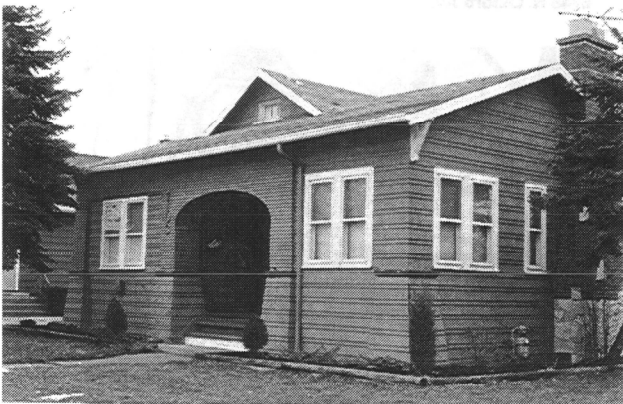
7103 N. Oriole Av.

The focus of the Chicago Historic Resources Survey was on buildings erected prior to 1940. Buildings and developments erected after that date generally are not included in the inventory.