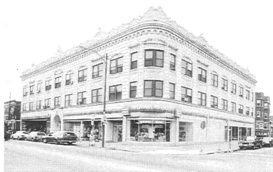
6234 S. Kedzie Av.