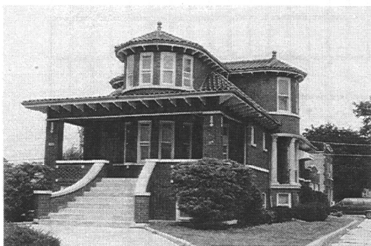
6557 S. Troy Av.