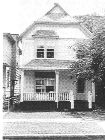
3443 W. 62nd Pl.