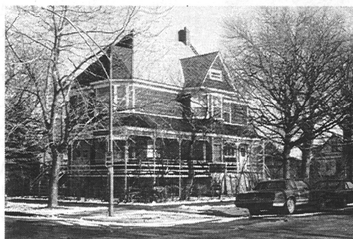
6357 S. Albany Av.

Annexation to Chicago occurred in 1889, and public transportation began to improve in the years following. In 1904, a leading Chicago architectural firm, D.H. Burnham & Co., collaborated with the