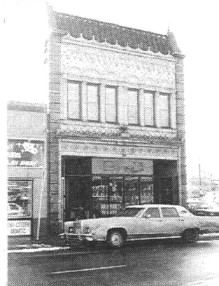
3145 W. 63rd St.

Survey information for this community area was accurate at the time it was first surveyed in July 1987. For an explanation of column headings, see page III-1.