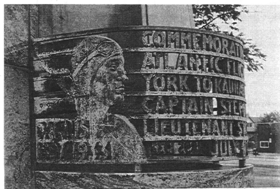
Darius-Girenas Monument 6720 S. Kedzie Av.