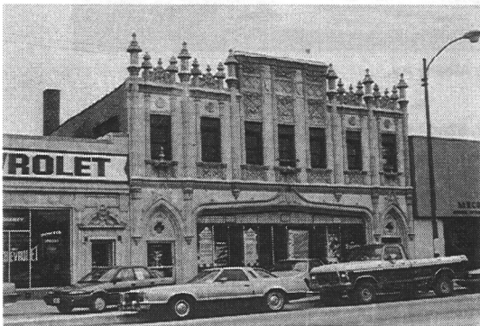
Haggerty Chevrolet 6731 S. Western Av.