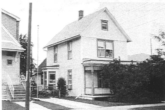
3541 W. 58th St.