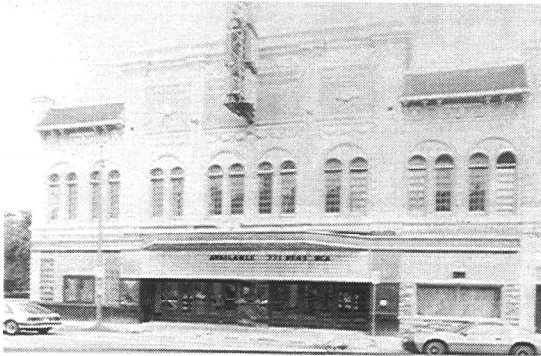
Colony Theater 5842 S. Kedzie Av.

Gage Park's commercial strips developed during the 1920s, especially those along Kedzie, 51st and 59th. Gage Park's example of a flamboyant movie palace is the Colony, a Classical Revival-style theater at 5842 S. Kedzie (1925). Interesting homes from the era include 5554 S. Sawyer (1926) and 5501 S. Richmond (c. 1935).