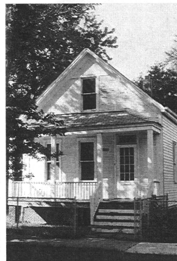
5126 S. Homan Av.

The community's greatest growth occurred between 1905 and 1919. Gage Park itself, located at the intersection between Western and Garfield boulevards, was laid out in 1905 by the South Park