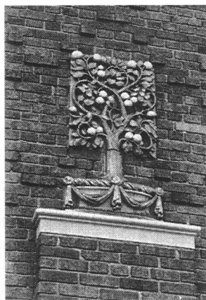
Dr. Walter S. Christopher School 5020 S. Artesian Av.