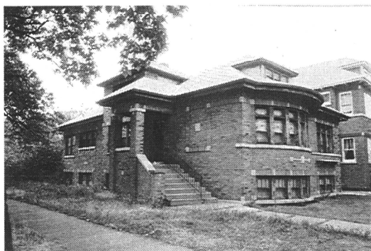
5554 S. Sawyer Av.