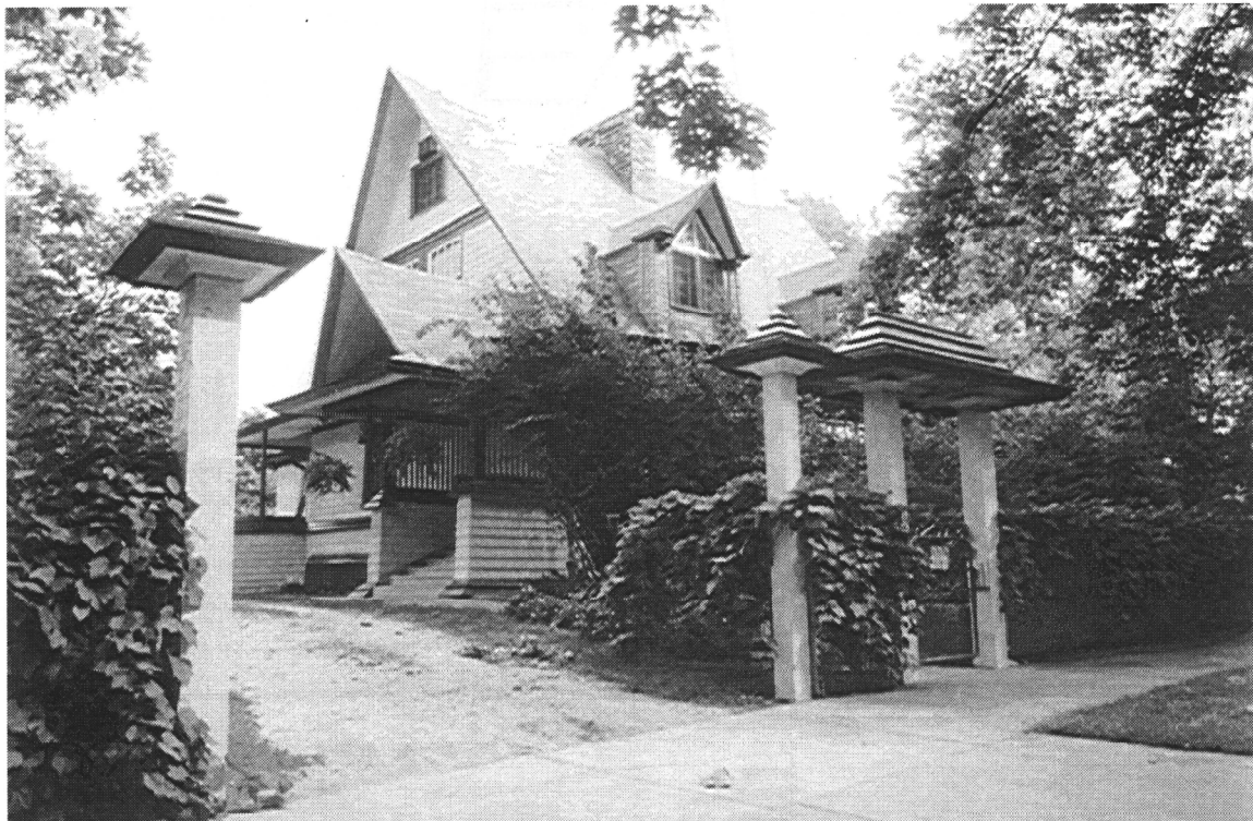
Stephen A. Foster House 12147 S. Harvard

Survey information for this community area was accurate at the time it was first surveyed in September 1983. For an explanation of column headings, see page III-1.