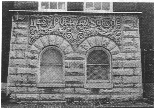
West Pullman School 11919 S. Parnell Av.