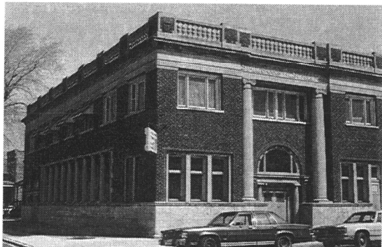
State Bank of West Pullman 622 W. 120th St.

The focus of the Chicago Historic Resources Survey was on buildings erected prior to 1940. Buildings and developments erected after that date generally are not included in the inventory.