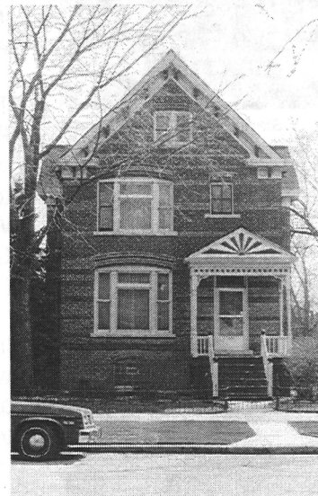
605 W. 116th St.

Taking its name from Pullman, the famous planned company town to the northeast, West Pullman originated as the settlement of Kensington near the Calumet station (1852, demolished) shared by the Illinois Central and Michigan Central railroads at 115th Street and Cottage Grove Avenue. Inhabited by a few truck farmers who brought goods into Chicago on the Holland Michigan Avenue Road, the community grew from State Street to the Illinois Central tracks between 115th and 125th streets. In 1881, the Gano Company of Cincinnati platted a subdivision west of State Street between 115th and 119th streets, which incorporated as the town of Gano in 1888. An Italianate-style house at 605 W. 116th Street survives from this period.