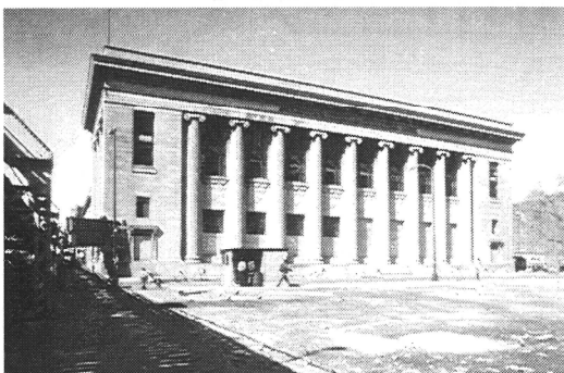
Woodlawn Trust and Savings Bank 1174 E. 63rd St.