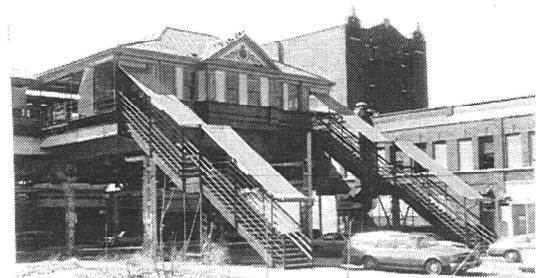
University Ave. elevated station, CTA Green line 1142 E. 63rd St.