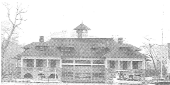
Coast Guard Station, Jackson Park 6401 S. Coast Guard Dr.

The focus of the Chicago Historic Resources Survey was on buildings erected prior to 1940. Buildings and developments erected after that date generally are not included in the inventory.