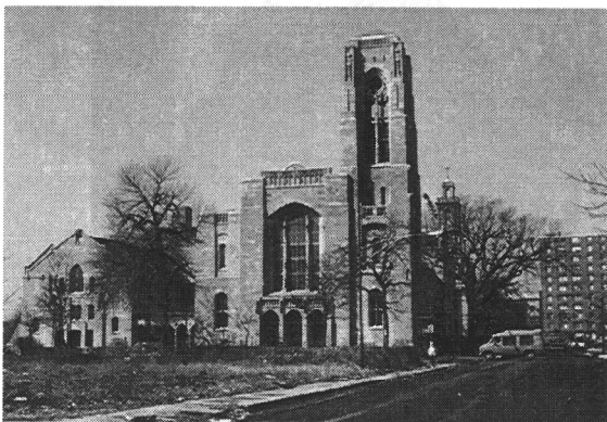
First Presbyterian Church 6400 S. Kimbark Av.