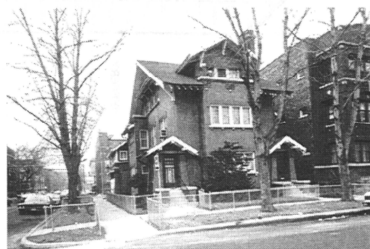
6156 S. Evans Av.