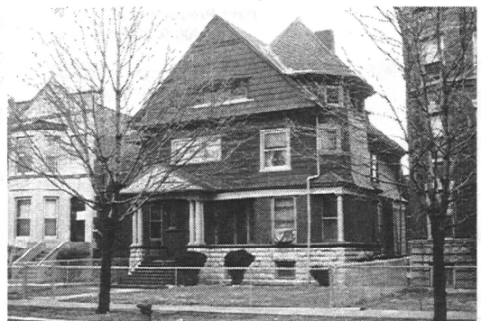
6627 S. Woodlawn Av.